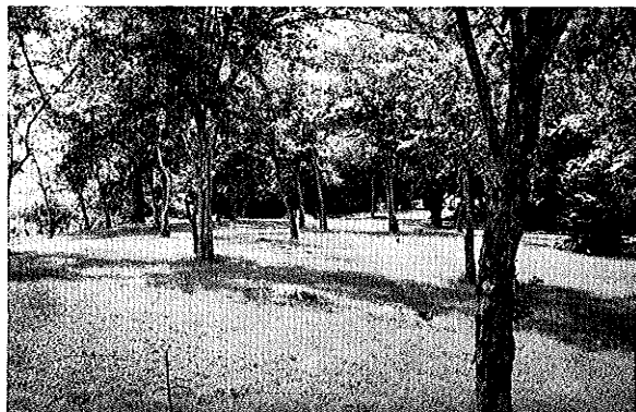
FIG. 1. Kingston Study Area

opalinus and A. l. lineatopus ) and permitted clear interpretations of interspecific behavior when the species came together. In addition, the limited habitat enhanced the competition for perch sites.